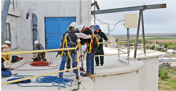
The crew learns how to safely tie off before beginning their descent off the Scott City Co-op elevator.

to a 170-foot tall tower owned by Wheatland Electric. The crew learned how to safely lower a conscious, but injured person, and finally a person who was unconscious, by attaching them to an able climber who could then bring the injured party safely to the ground.