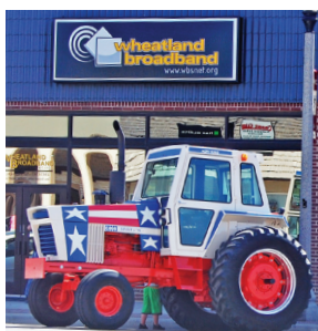
Wheatland Broadband held a registration day in May for this fully-restored Spirit of '76 Case 1030.

Wheatland Broadband employees served lunch for those who registered and held a drawing for a $50 Visa gift card and four tickets to Schlitterbahn Waterpark in Kansas City. Wheatland Electric plans to host another registration day later this summer in Tribune. Watch this magazine for the time and date for your chance to register and grab some lunch at the Tribune office.